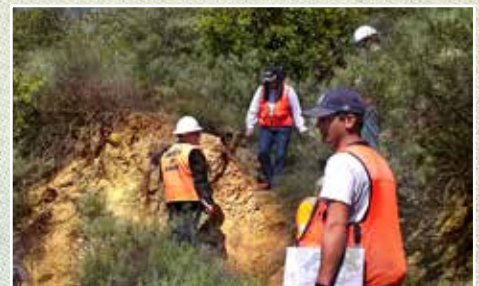
Field visit with California Division of Safety of Dams and Federal Energy Regulatory Commission.

The dam's two regulatory agencies, the Federal Energy Regulatory Commission and the California Division of Safety of Dams (DSOD) have approved the restriction. The restriction will allow the reservoir to fill up to 68 percent of its full storage capacity. Water district staff and the regulatory agencies believe that this would prevent the uncontrolled release of water in case of a failure after a major earthquake.