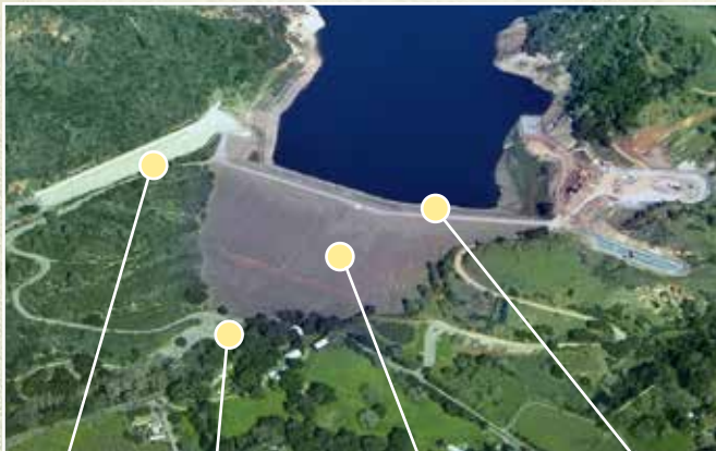
SPILLWAY OUTLET PIPE DAM EMBANKMENT CREST OF DAM