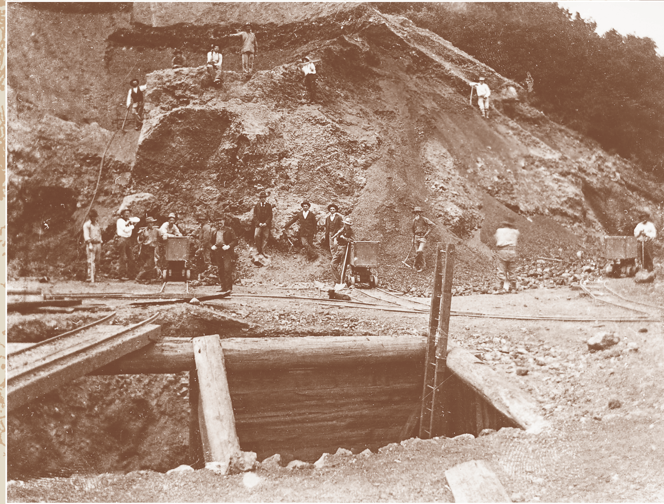
Yellow Kid Stope, where the Harry Shaft broke surface from 500' level