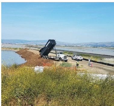
Soil delivered to Pond A12 for levee construction.